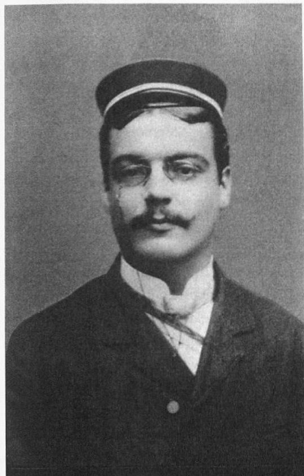
FIGURE 3.1 Alois Alzheimer in 1884 as a member of the Würzburg Franconian Corps